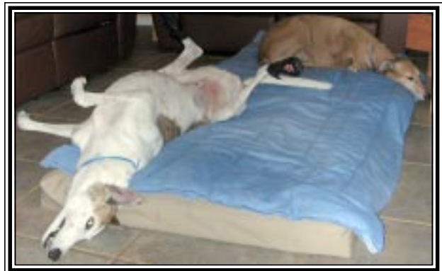
Polo and Jesse Zap

Things do not always come easy so sometimes in order for you to have the perfect dog you have to learn to be the perfect owner.