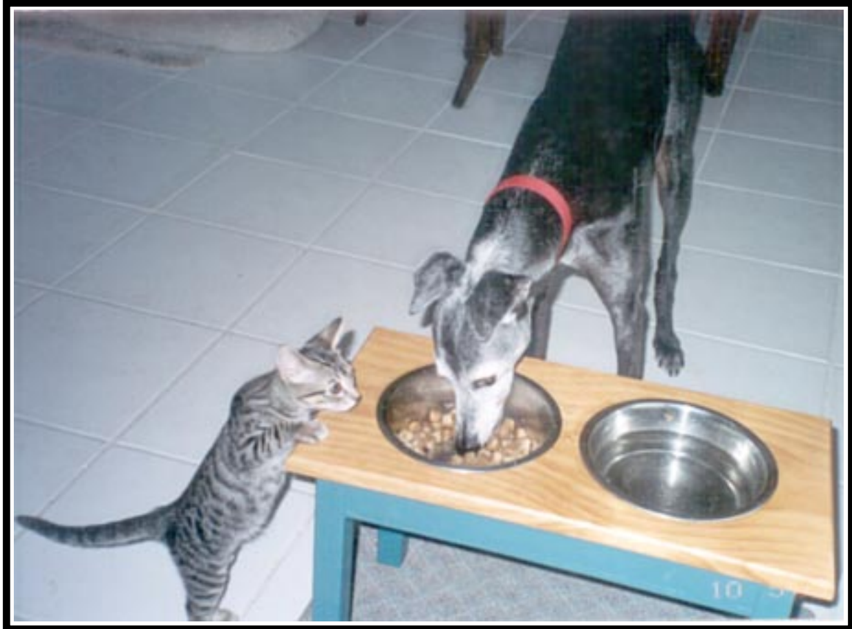
Rudoph Valentino a.k.a. "Rudy" watches closely as Ruby eats her dinner

Greyhound Pets of America ~ Florida Southeast Coast Chapter